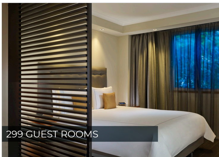
299 GUEST ROOMS