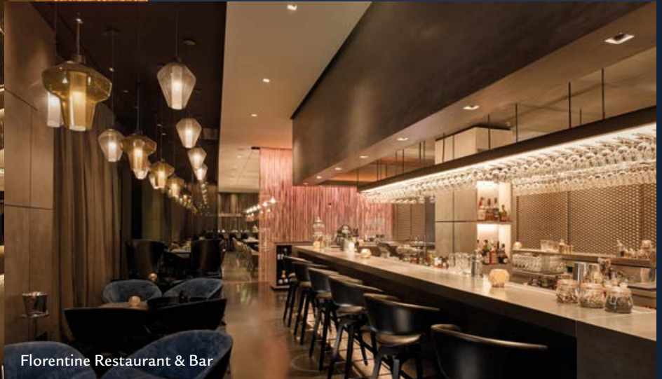
Florentine Restaurant & Bar