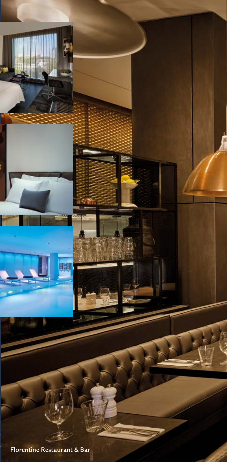
Florentine Restaurant & Bar