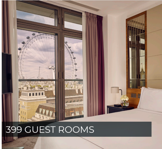
399 GUEST ROOMS