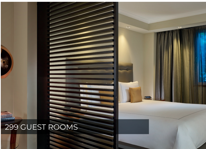
299 GUEST ROOMS