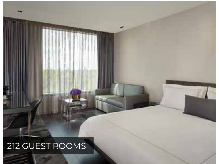
212 GUEST ROOMS