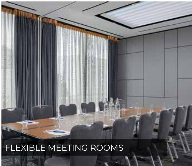
FLEXIBLE MEETING ROOMS