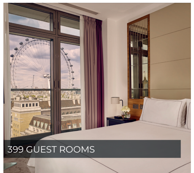
399 GUEST ROOMS