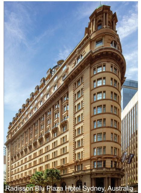
Radisson Blu Plaza Hotel Sydney, Australia

Radisson Blu design counts on inspiring local touches and artworks that capture the feel of the destination. Our spaces are lively settings that are dynamic and vibrant with light, airy, spacious environments that provides meaningful and contemporary design. A full technical guideline and tools enabling the development or renovation are available to our partners.