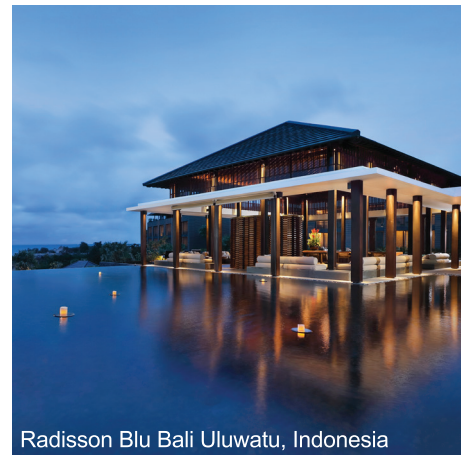
Radisson Blu Bali Uluwatu, Indonesia