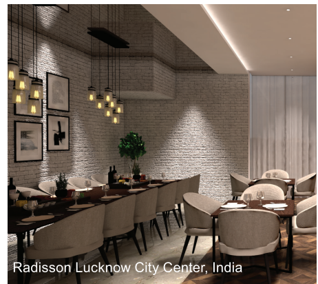
Radisson Lucknow City Center, India