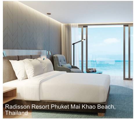
Radisson Resort Phuket Mai Khao Beach, Thailand